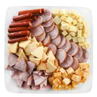
Simple Meat & Cheese

A perfect way to start a meal or serve with drinks. Includes prosciutto, sopressata, and capocollo cured meats, plus Parmigiano Reggiano, bocconcini, and fontina cheeses. Serves 8-12.