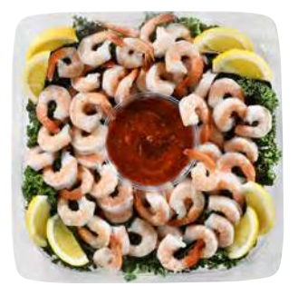
A Sea of Shrimp Party-perfect large cooked shrimp with lemon wedges and seafood cocktail sauce. Serves 4-5.