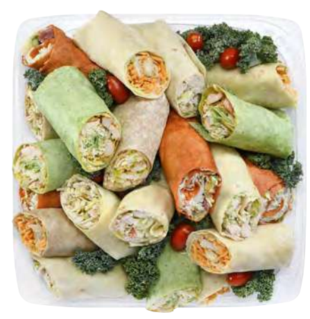
Take the Wrap An appetizing assortment of freshly prepared wraps, including Chicken Caesar, Crispy Chicken, Turkey Club, Buffalo Chicken, and Seven Grain Veggie. Ask in store for full selection. Small serves 5, large serves 10.