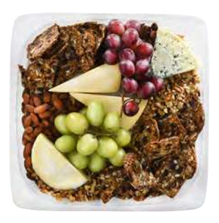
Hello Castello! A delectable collection. Small platter includes: Castello

creamy white cheese, traditional blue, and aged havarti. Serves 10-12.