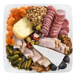
Charcuterie & Cheese

A selection of our favourites including Applewood smoked cheddar, brie, Gouda, and Parmigiano Reggiano. Serves 10-12.