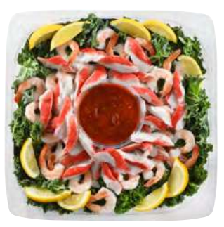
Seafood Party Two favourite seafoods in one platter: shrimp and surimi (crab-flavoured Pollock and whiting), with lemon wedges and seafood cocktail sauce.